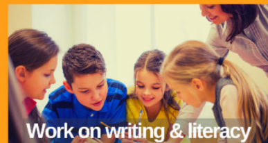
Work on writing & literacy

With the summer months here, children and teens could start to feel their young minds forgetting what they've learned all school year. With that concern, educators have decided to share some tips that they believe can help students stay academically engaged while out of school.