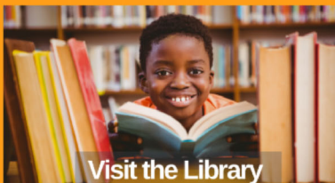
Visit the Library