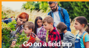
Go on a field trip